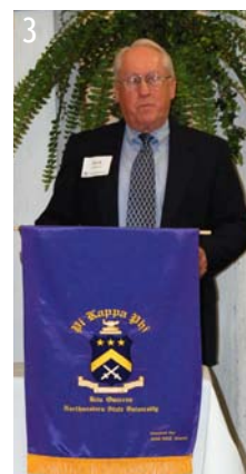
3) Scholars Program seeks to inspire certain student outcomes based on academic performance, service to Pi Kappa Phi, and service to Northwestern State University, all while holding down part-time employment. It's the intent of the program to reward students who find success while giving